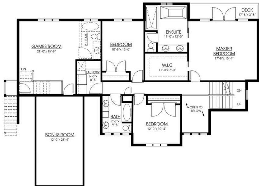
UPPER FLOOR PLAN - 1496 SQ FT Victoria