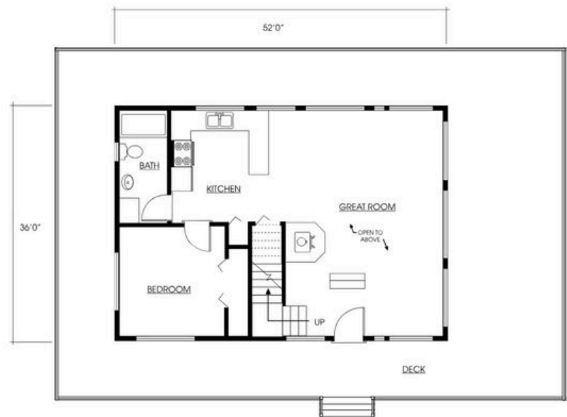
MAIN FLOOR PLAN - 816 SQ. FT Woodside

Designed for singles, couples, and downsizers, the Woodside offers the best of both worlds: open-concept interiors flooded with natural light and a design aesthetic that blends natural materials with modern elegance.